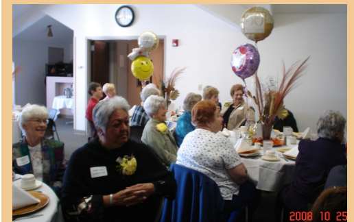
Members of the Class of 1958 gathered at Homecoming 2008.

The memory book is a compilation of information, stories and memories from the reunion classes. All members of each reunion class will receive a copy of the book. If you are a member of a reunion class, you will receive a memory book form to complete and return with your award nominations and your reservation card.